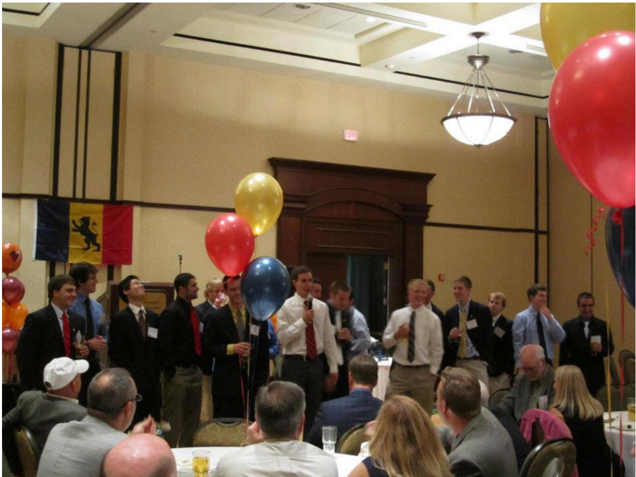
Active chapter speech at the Sigma Alpha reunion