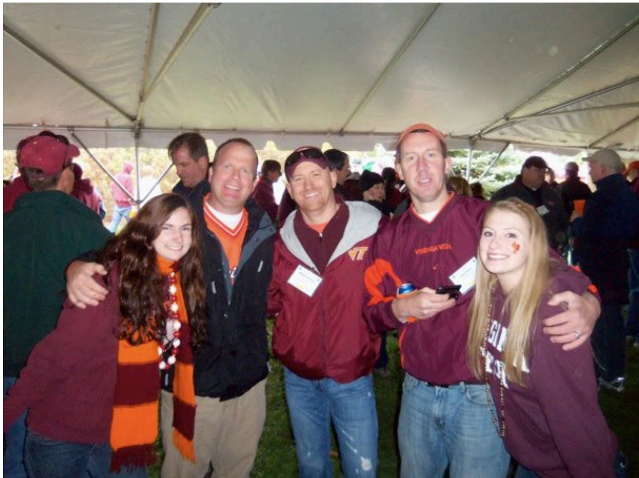
Little sisters and alumni at the tailgate club